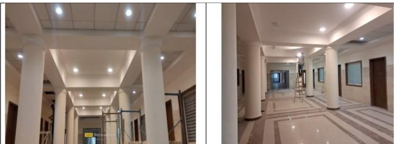
Energy Efficient Appliances Usage: Use of LED lighting and lamps (New Abbas Campus, Alexandria University)