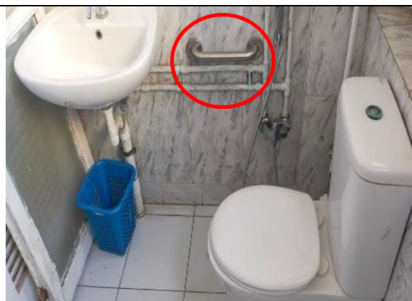
Accessible toilet (Alexandria University)