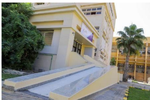
Replacing steps with ramps for disabled people (Faculty of Engineering - Alexandria University)