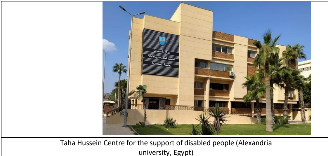
Taha Hussein Centre for the support of disabled people (Alexandria university, Egypt)