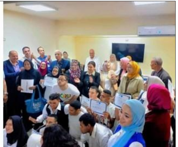
Alexandria University admission for students with special needs, the disabled and maternity care (Disables Service Center on the Faculty of Commerce)