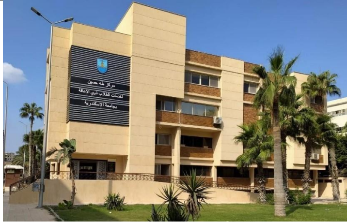
Taha Hussein Centre for the support of disabled people (Alexandria university, Egypt)