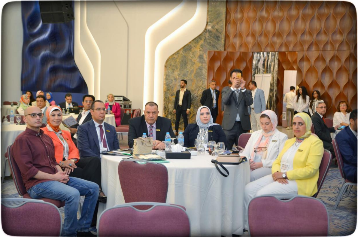
Opening of the seventh scientific conference of the Faculty of Economic Studies and Political Science