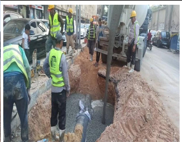
Integrated strategy project for rainwater management in Alexandria Governorate in cooperation with Alexandria University