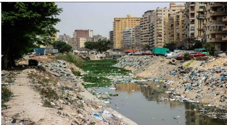
Before performing the integrated strategy project