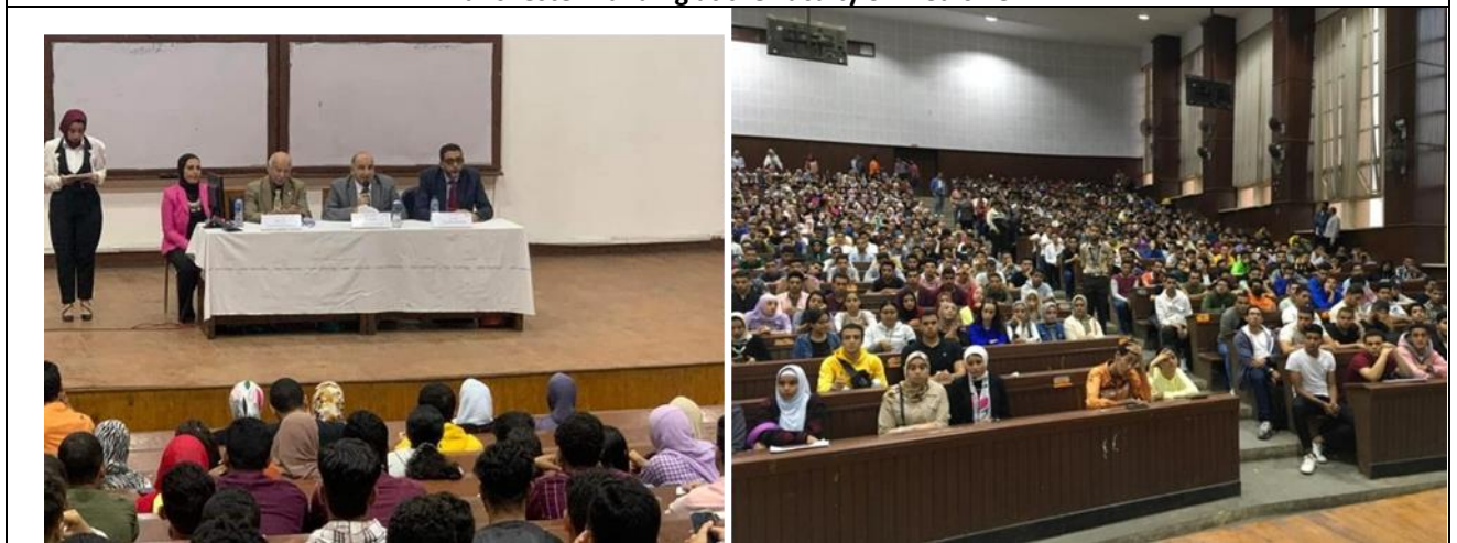
The Minister of Higher Education chairs the meeting of the Supreme Council of Universities at Alexandria University supporting the “Egypt Digital Cubs” initiative organized by the Ministry of Communications and Information Technology, by allowing the use of electronic testing laboratories spread throughout all public universities , to conduct admission tests for applicants, by activating a tripartite cooperation protocol between the Ministry of Higher Education and Scientific Research, the Ministry of Communications and Information Technology, and the presidents of public universities. The Ministry launched the green financing initiative for research, development and innovation to support applied projects that contribute to solving environmental problems, nature conservation, clean energy, waste recycling, etc. They also reviewed the ongoing partnerships between the Ministry and various countries of the world, the Association of African Universities, and the Union of Arab