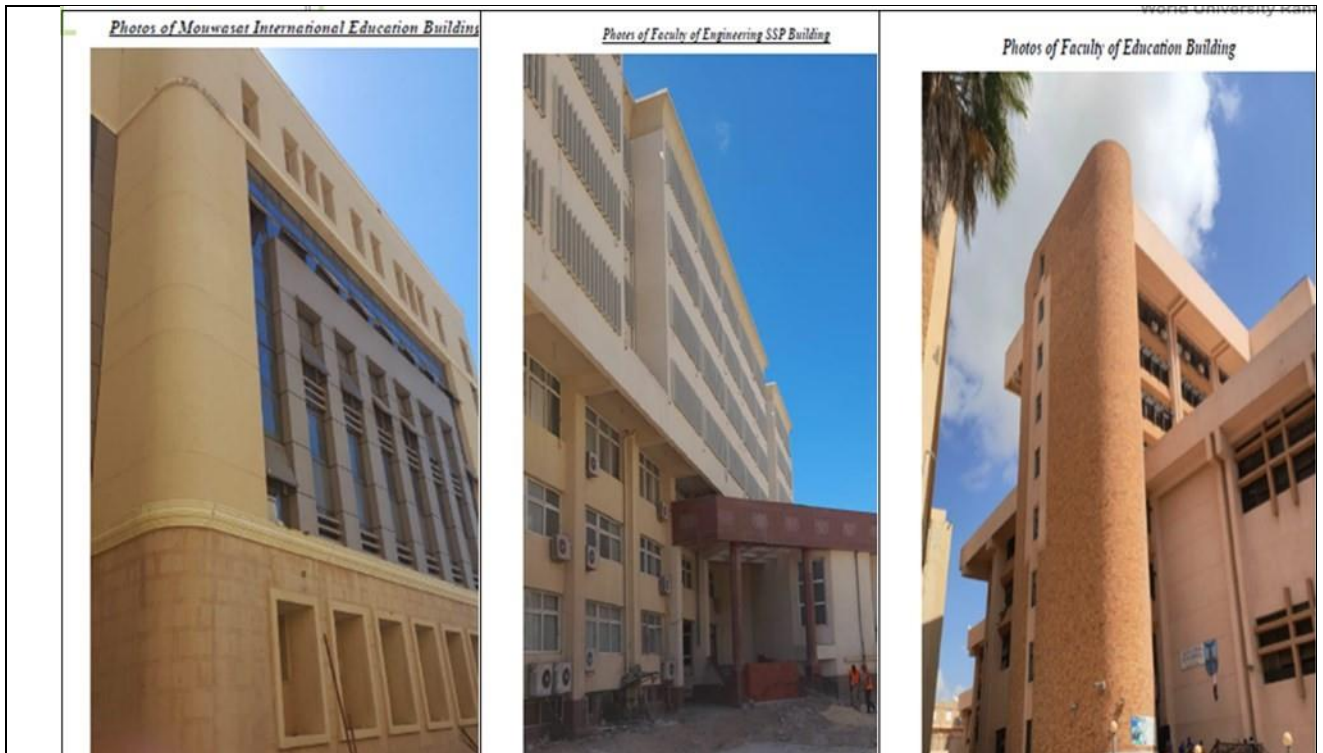
The European Union project to convert several buildings of Alexandria University into green buildings by reducing energy consumption in addition to establishing solar-powered power stations: the Specialized Scientific Programs Building at the Faculty of Engineering, the Faculty of Education Building within the Literary Colleges Complex, and the Manchester Building at the Faculty of Medicine.