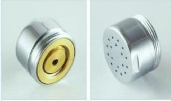
Supplying water taps with water conservation units (Alexandria University, Egypt)