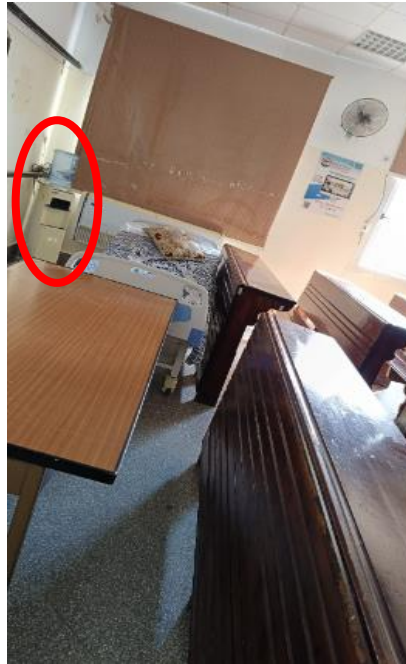
Study room at the faculty of Medicine