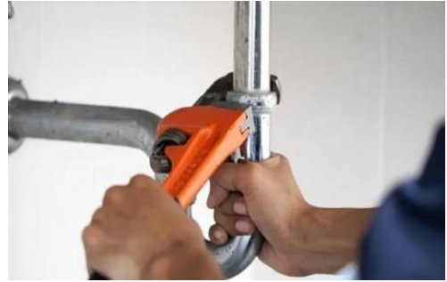
Adopting a mechanism to maintain water pipes to prevent waste resulting from leaks (Alexandria University, Egypt)